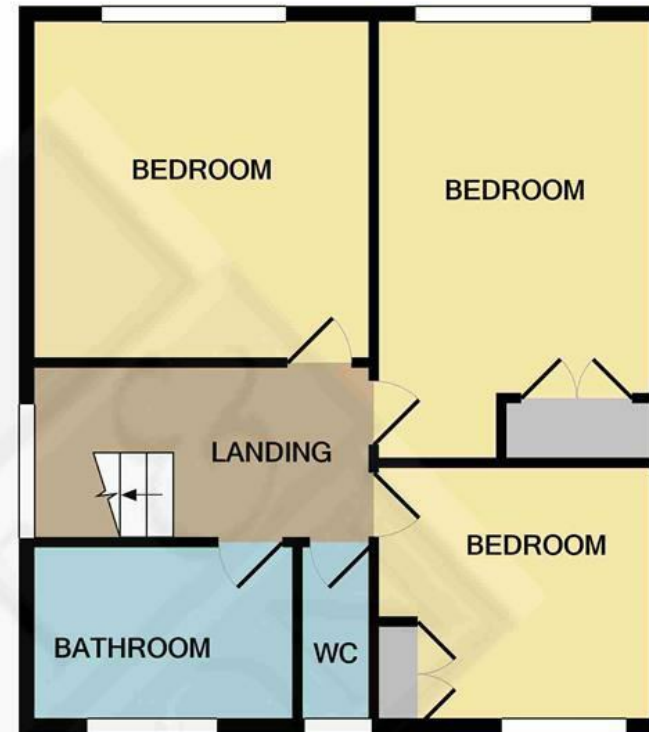
1ST FLOOR APPROX. FLOOR AREA 443 SQ.FT. (41.2 SQ.M.)

TOTAL APPROX. FLOOR AREA 974 SQ.FT. (90.4 SQ.M.)